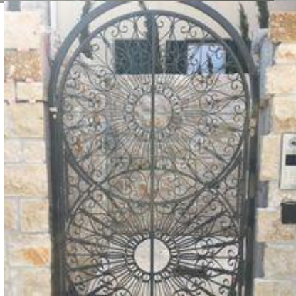
6.Lustica Chedi Hotel faza H & F