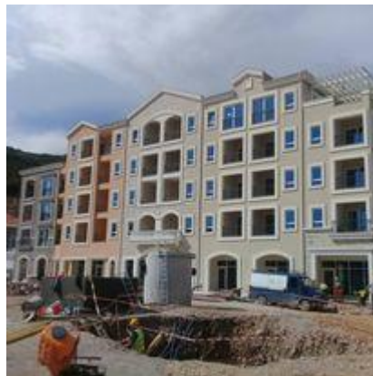
7.Razuporna konstrukcija Budva